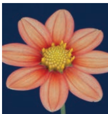
'Inflammation' Mignon Single