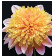
'Goldie Gull' Anemone flowered