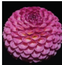
'Elfin' Pompon