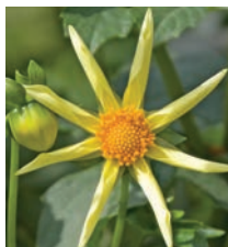
'Honka' Orchid flowered