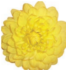
'Karma Ventura' Formal Decorative/ Water-Lily flowered Farmers' West Flowers & Bouquets