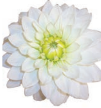
'Karma Maarten Zwaan' Formal Decorative/ Water-Lily flowered Farmers' West Flowers & Bouquets