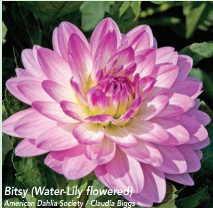
Bitsy (Water-Lily flowered)