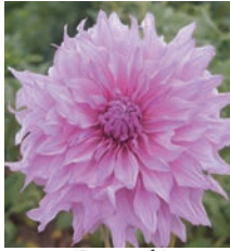
'Pennsgift' Informal Decorative