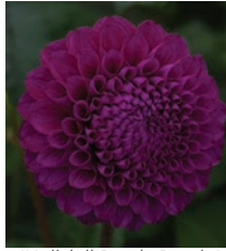
'Hollyhill Purely Purple' Formal Decorative