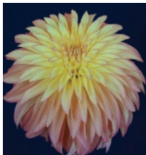
'Camano Pet' Stellar