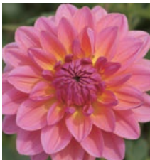
'Wildwood Marie' Water-Lily flowered