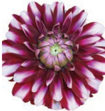
'Karma Yin Yang' Formal Decorative Farmers' West Flowers & Bouquets