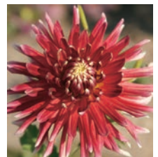
'Akita' Novelty Fully Double str