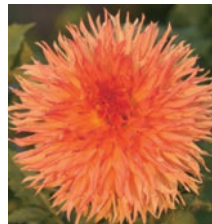
'Papa's Benji' Laciniated