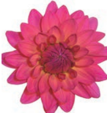
'Karma Fuchsiana' Formal Decorative/ Water-Lily flowered Farmers' West Flowers & Bouquets