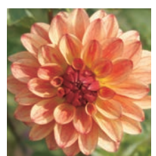
'Crazy Legs' Stellar