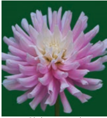
'Chilson's Pride' Informal Decorative American Dahlia Society