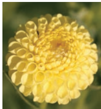
'Yellow Baby' Pompon