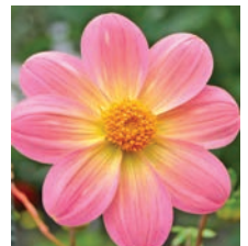
'Dandie Sunrise' Single