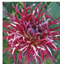
'Hollyhill Spider Woman' Novelty Fully Double