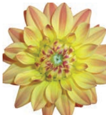
'Karma Corona' Semicactus Farmers' West Flowers & Bouquets