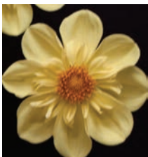
'AC Coy' Collarette