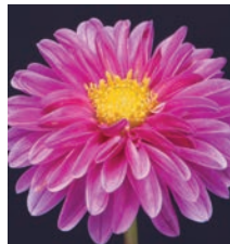
'Elvira' Peony flowered American Dahlia Society