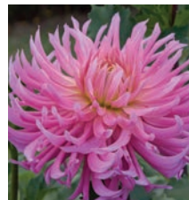
'Hollyhill Cotton Candy' Incurved Cactus