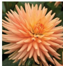
'Embrace' Semicactus