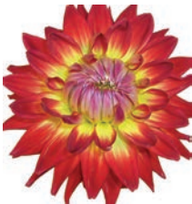
'Karma Bon Bini' Straight Cactus Farmers' West Flowers & Bouquets