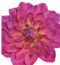
'Patty' Water-Lily flowered Farmers' West Flowers & Bouquets